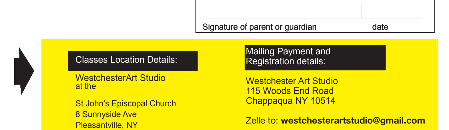
Photo Release: I give permission for my child to be photographed at Westchester Art Studio. I understand and agree that all rights to these photographs are reserved by and shall become the property of Westchester Art Studio, and may be used for promotion and publicity by Westchester Art Studio only, including on the website, in print media, on television, or online. No children's names will be associated with photos.

We will need a minimum of 2 hours notice before class begins for a credit or refund if you need to cancel.