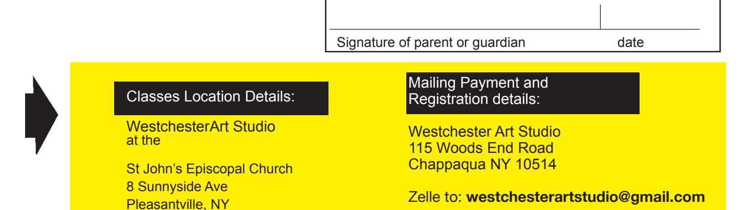
Photo Release: I give permission for my child to be photographed at Westchester Art Studio. I understand and agree that all rights to these photographs are reserved by and shall become the property of Westchester Art Studio, and may be used for promotion and publicity by Westchester Art Studio only, including on the website, in print media, on television, or online. No children's names will be associated with photos.

We will need a minimum of 2 hours notice before class begins for a credit or refund if you need to cancel.